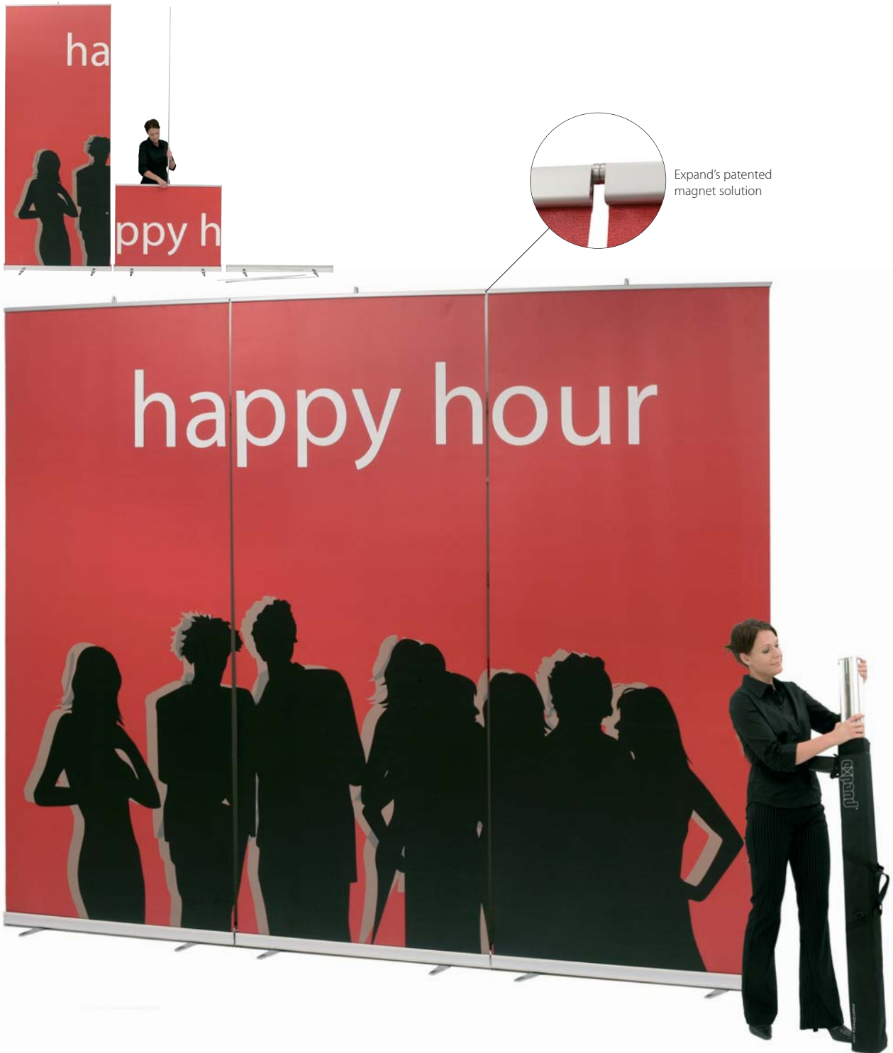
Expand's patented magnet solution