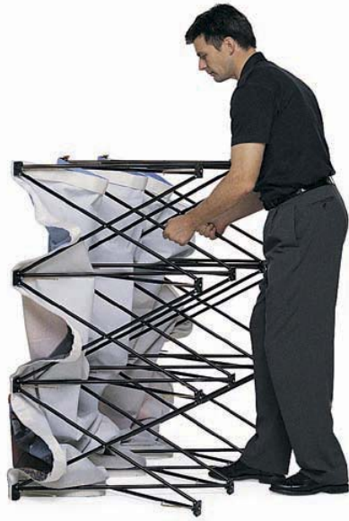
2. Open the frame