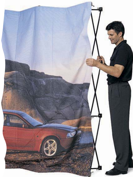
3. Connect all of the metal hooks