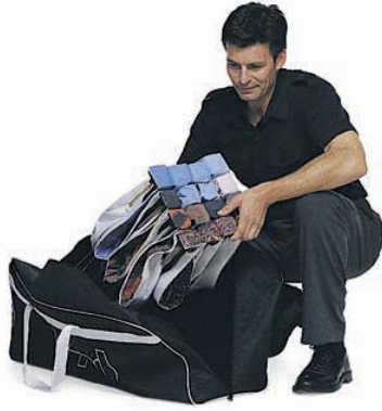
1. Open the nylon bag and remove the frame